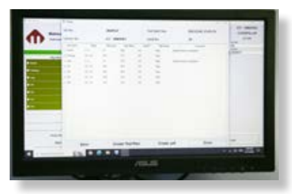
Test Report as PDF File

New Control Application controls the pump speed according to flow demand to minimize the return of high temperature flow to the tank. As a result TK2024 has heating demand more than cooling demand.